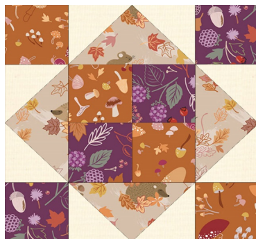
Block 3- sew 4 this way

Stitch the centre squares together the top 2 and then the bottom 2. Now sew the strips together to make a square. Stitch each of the rows together and then sew the rows together to complete the block.