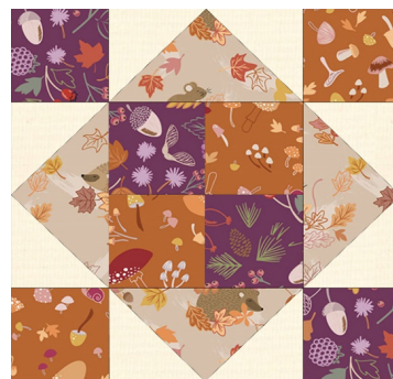
Block 4- sew 4 this way