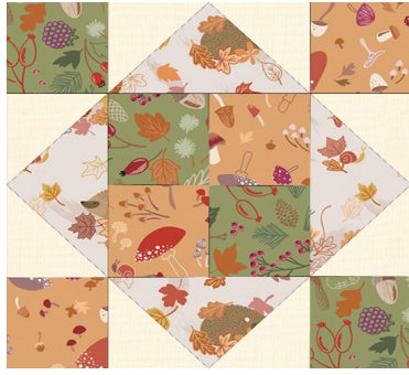
Block 4- sew 2 this way