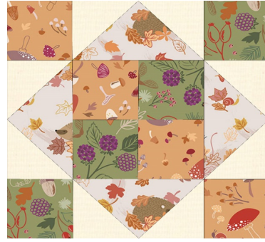
Block 4- sew 2 this way