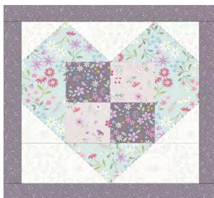
Block 1 Diagram